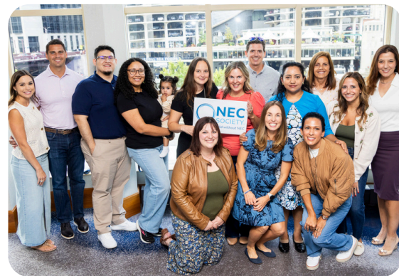
Families at the NEC Symposium in Chicago

We are committed to ensuring diverse, inclusive, and equitable representation by welcoming participants across geographic regions, lived experiences, and backgrounds to join.